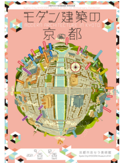
Art Direction: Ouchi Osamu Illustration: Nakagawa Gaku

Many examples of significant architecture appeared in Kyoto as the city re-emerged from a period of decline following transfer of the national capital from Kyoto to Tokyo at the beginning of the Meiji Period (1868 – 1912). Kyoto subsequently took a leading role in the fields of education and advanced technology, culture and tourism. Fortunately, many 'modernist' structures, both Western-style and modern Japanese, remain to this day and give Kyoto an important position in the representation of Japan's modernization. With rich experience in the preservation of historically important architecture, Kyoto is a living architecture museum displaying many types of ancient and pre-modern traditional Japanese architecture side by side with modern and contemporary buildings. This first large-scale architecture exhibition at the Kyoto City KYOCERA Museum of Art, itself a noteworthy example of Kyoto modern architecture, offers visitors the opportunity to become familiar with Kyoto through the city's architecture. A variety of materials, including rare original drawings, models, furniture, photographs, and films conveying the spirit of this particular time of history will be on display. Moreover, walking tours arranged during the exhibition period will make it possible to explore the city and experience the architecture, gardens, and charm of Kyoto.