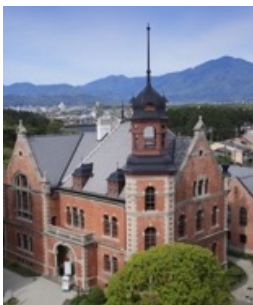
Clarke Memorial Hall, the Doshisha

The Catholic, Protestant, Anglican, and Russian Orthodox denominations all built bases and conducted activities in Kyoto from the early Meiji period. In this section, the relation of missionary ideals to the design of Christian, or missionary, architecture is considered.