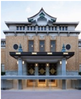
Kyoto Enthronement Memorial Museum of Art (Current Kyoto City KYOCERA Museum of Art)

The question of what kind of architecture is suitable for Japan has been posed since early Meiji period study of Western architecture. The attempt to bridge the gap between Japanese and Western models started with review of Asia and Europe and sometimes Chinese and Middle Eastern elements. Such architecture that combines elements from Japan and other cultures may be most suitable for Japan.