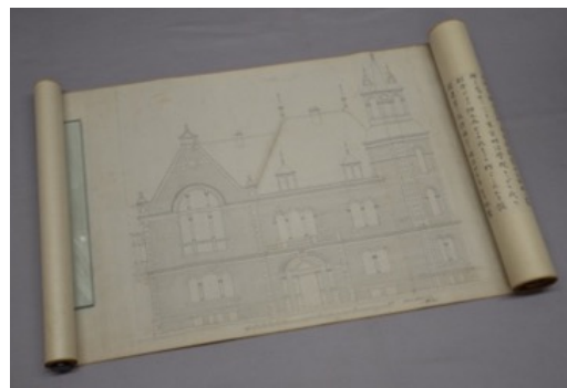
Clarke Memorial Hall, the Doshisha Design of Byron Stone Clarke Memorial Hall 1892 (Meiji 25), National Important Cultural Property Total length approx. 10m Collection: Doshisha University