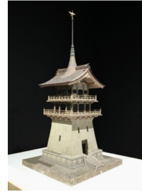
Villa Okura in Kyoto (Current Daiun-in Temple), Gion-kaku Model 1:20 ca. 1928 (Showa 3) h1683 x w805 x d805 mm Created by Sakamoto Jintaro (Architectural model maker) Collection: Okura Museum of Art