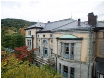
Chourakukan (Former Villa Murai Kichibei Kyoto)

Western-style architecture took root in Kyoto only in the late Meiji period (1868-1912), after having developed in Osaka and Tokyo. Sophisticated Baroque, Renaissance, Tudor, and Spanish styles appeared in the buildings of government offices, banks, and private residences. The vitality of such buildings in different architectural styles is among Kyoto's many attractions.