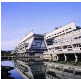
Kyoto International Conference Hall

Breaking away from stylized architecture, architects prior to World War II pursued rational design, facilities, and construction. In the post-war period, architects accepted, developed, and expanded on international trends. This section gives an overview on preserving architecture in Kyoto for the future — structures that anticipated the arrival of a new era, structures that inherited the aesthetics of modernism but at the same time incorporated elements of traditional culture, structures that succeeded in creating spaces fitting to the environment.