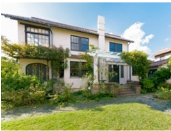
Dr. Komai's Residence

In the latter half of the Meiji period, scholars, artists, and writers began to relocate from Kyoto's city center to its outskirts. They sought a quiet and spacious living environment with views of nature and mountains, and a modern lifestyle with neighbors and community. The modern home and its surroundings conveyed the hopeful ideals of the time.