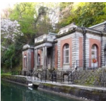
Former Imperial Palace Waterway Pump Station

Kyoto prospered as the seat of the Imperial Court for over 1000 years, starting from the Heian period (794-1185), with aristocratic families as well as feudal lords present until the city's decline with the transfer of the national capital to Tokyo at the beginning of the Meiji period (1868-1912). Official and private groups worked together on reconstruction in the Meiji period, with education and industry as driving forces. In this section, projects are introduced that symbolize the revitalization of Kyoto through incorporation of Western ideas and technology.