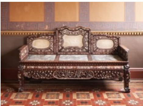
Chourakukan (Former Villa Murai Kichibei Kyoto) Lacquered chair with mother-of-pearl inlay Before Taisho era h1050 x w1830 x d650 mm Collection: Chourakukan