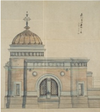
Imperial Museum of Kyoto (Current Kyoto National Museum) “Main Gate Guard House, Front Elevation Drawing at 1/20 Scale”, ca. 1895 (Meiji 28), National Important Cultural Property h500 x w446 mm Collection: Kyoto National Museum

Nationally designated Important Cultural Properties along with a wide range of blueprints, photographs, sketches, models, furniture, videos, and manuscripts.