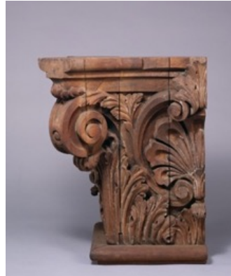
Imperial Museum of Kyoto (Current Kyoto National Museum) Column capital, carved wood model, ca. 1895 (Meiji 28), National Important Cultural Property h 624 x w482 x d482 mm Collection: Kyoto National Museum